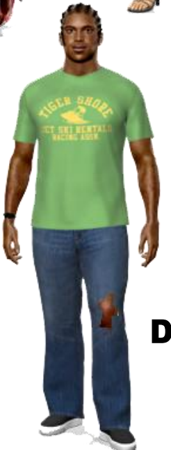
Figure D: Ripped and baggy jeans, slip on shoes, wearing a bracelet that is not an id bracelet, and wearing a large logo fitted shirt.

Figure C: Sleeveless tank top, brightly pattern shorts, sandals, tattoos are showing, and hair is not trimmed properly